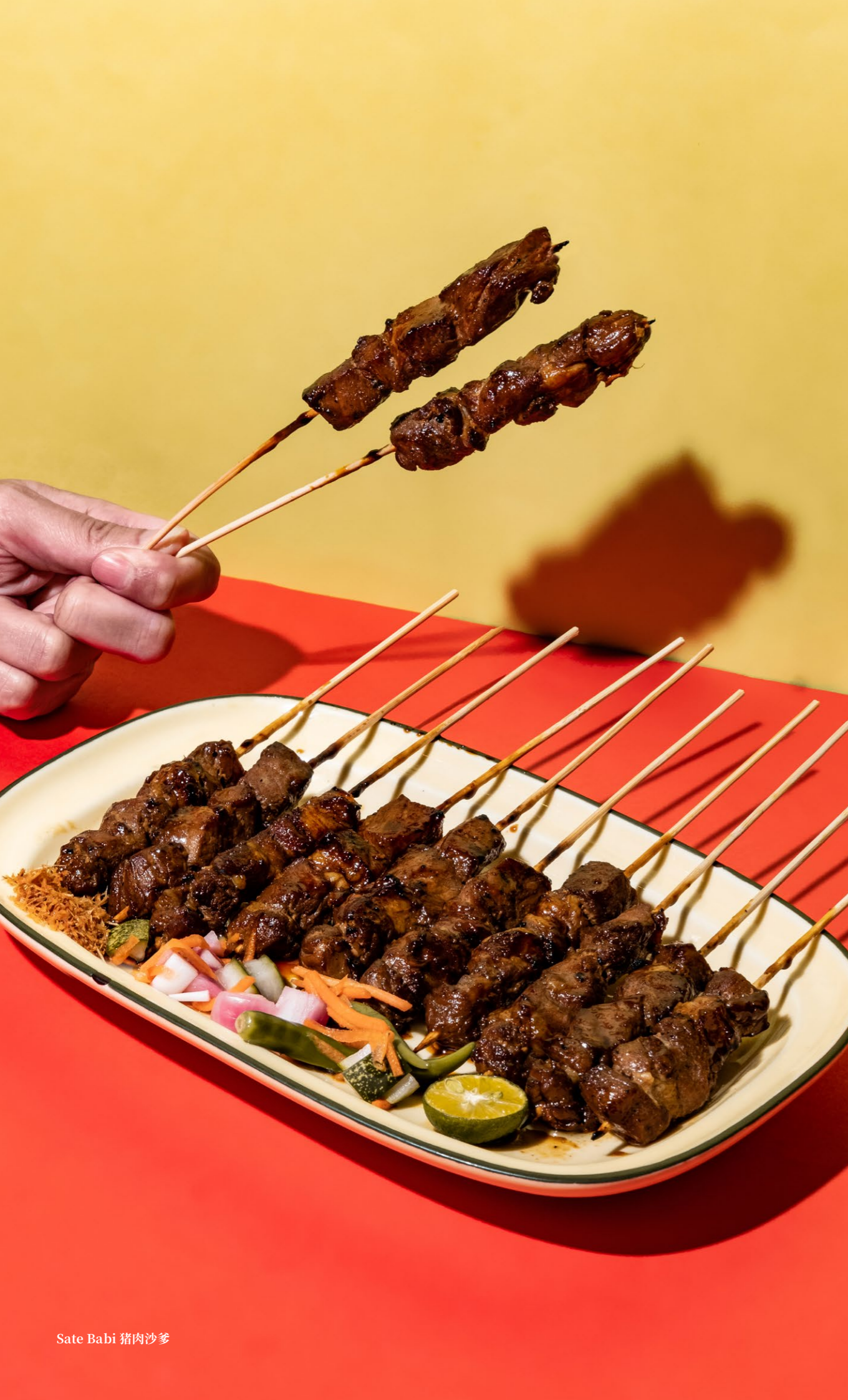
Sate Babi 猪肉沙爹