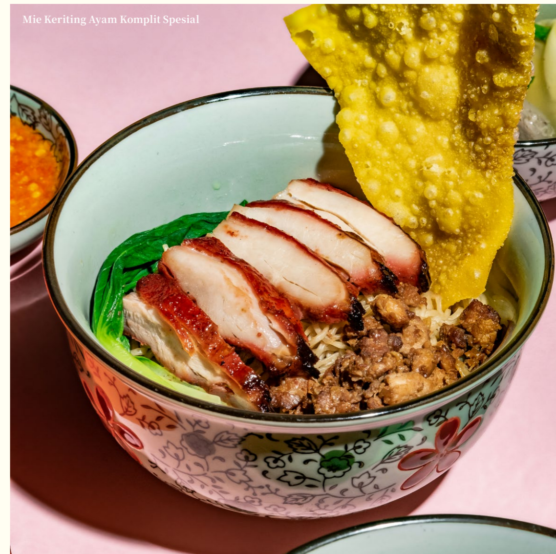
Mie Keriting Ayam Komplit Spesial