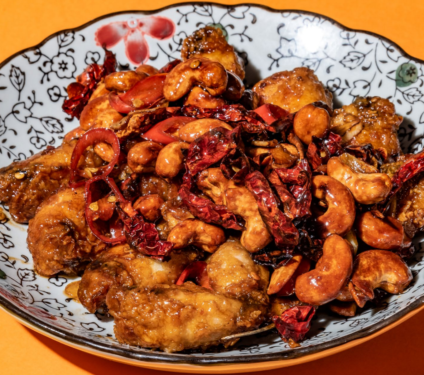
Kodok Goreng Kungpao 宫保炒田鸡