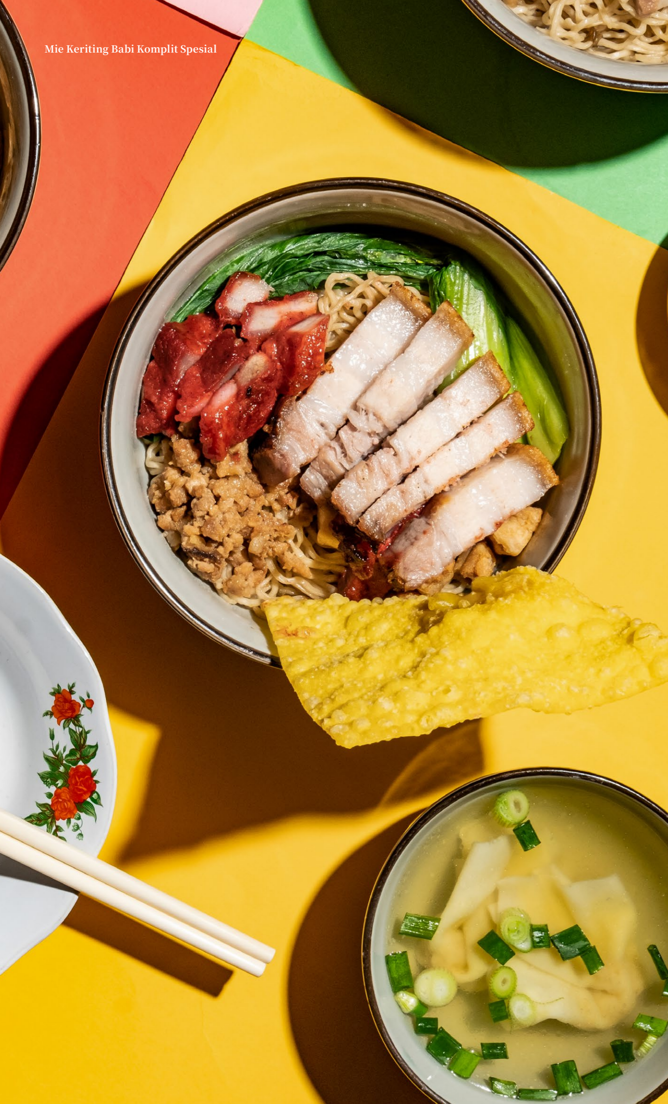
Mie Keriting Babi Komplit Spesial