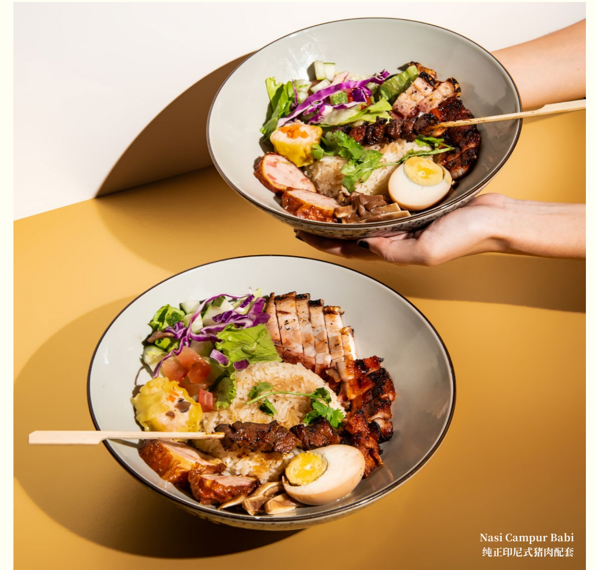
Nasi Campur Babi 纯正印尼式猪肉配套