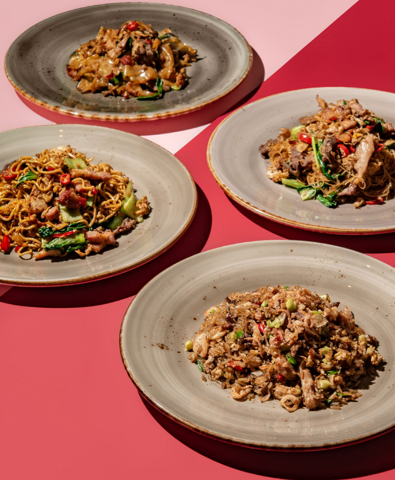
Kwetiau Goreng Spesial Kota88 招牌炒河粉 | Bihun Goreng Spesial Kota88 招牌炒米粉 Mie Goreng Spesial Kota88 招牌炒面 | Nasi Goreng Spesial Kota88 招牌炒饭